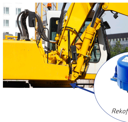
Figure 1: Slip ring for power and signals

insulating contaminants coming between these two sliding conductive surfaces.